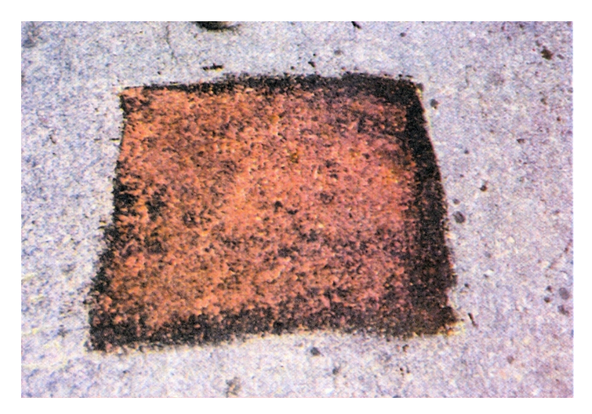
FIGURE 47-2 B: Partial Penetration