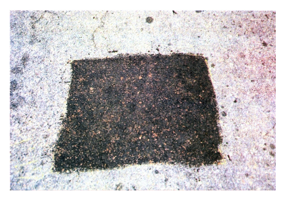
FIGURE 47-2 A: Total Penetration